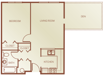
Unit A 1 Bedroom, 1 Bath 612 Square Feet 750 Square Feet with Den