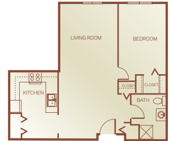
H.C. Unit 1 Bedroom, 1 Bath 803 Square Feet