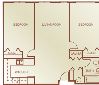
Unit F 2 Bedroom, 1 Bath 968 Square Feet