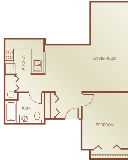
Plan 1C 1 Bedroom, 1 Bath 675 Square Feet