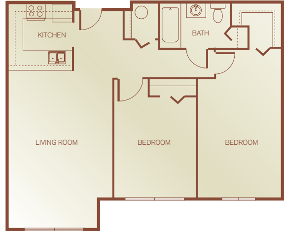
Plan 2B-A 2 Bedroom, 1 Bath 934 Square Feet